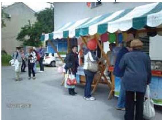
CDI Univerzum participated in the The Week of Lifelong Learning event. The photo features our stands during the event.

The institution participated in the Operational Programme for Human Resources Development (2007-2013), co-financed by the European Social Fund (ESF), and the Ministry of Education, Science and Sports. The project focused on increasing the involvement of the region's inhabitants in various forms of lifelong learning, thereby increasing employability, flexibility, and social cohesion. It also provided easy access to counselling and information services in the area of education to all groups of adults in the region.