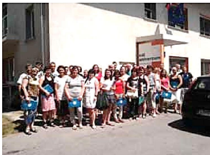
Candidates who have passed the vocational final exam ("poklicna matura").

The education programmes we provide are mostly formal, and follow the national curriculum. They include primary education, and a number of vocational programmes at the secondary level (gardening, catering, tourism, retail, mechanics, IT, administrative and business studies). We offer the options of three-year, four-year, or five-year courses, and/or a pick of individual specialization subjects or modules (NVQs). The majority of courses include some kind of practical work, which gives the students a chance to get an insight into their future jobs and perhaps even establish contacts with future employers.