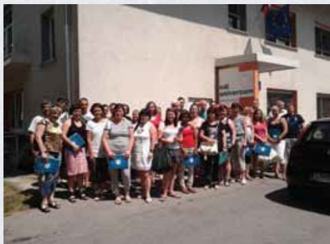
Candidates who passed the "poklicna matura" exam in June 2012.

The education programmes we provide are mostly formal programmes which follow the national curriculum. They include primary education and a number of vocational programmes at secondary level: gardening, catering, tourism, retailing, mechanics, IT, administrative and business studies. There are options to do a three, four or five year course and/or pick individual specialist subjects or modules (NVQs). The majority of courses include some kind of practical work - this gives the students a chance to get an insight into their future jobs and perhaps even establish contacts with future employers.